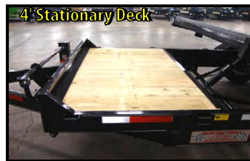
4' Stationary Deck