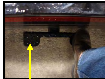
Bed Latch Release